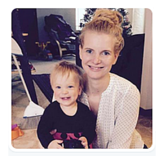
Pernille Ripp @pernilleripp